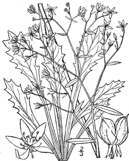
Micranthes petiolaris (Rafinesque) Brouillet & Gornall

Saxifraga has long been recognized as a large, polymorphic, and complex genus, primarily distributed in the northern hemisphere of Eurasia and North America, and partial to mountainous and arctic-alpine areas. The name means “stone breaker” and refers to the rock crevice habitat of many Saxifraga species and the suggestion that Saxifraga plants break rocks apart with their roots, but, which came first, the soil-filled crevice or the plant? To those of us who know Saxifraga only from eastern North America, it is a revela-